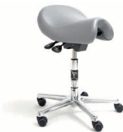
Bambach® Saddle Seat Large Ergotherapeutic Seat

Please specify desired color – color samples on request.