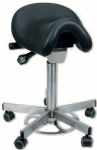
Bambach® OP Ergotherapeutic Seat

Please specify desired color – color samples on request.