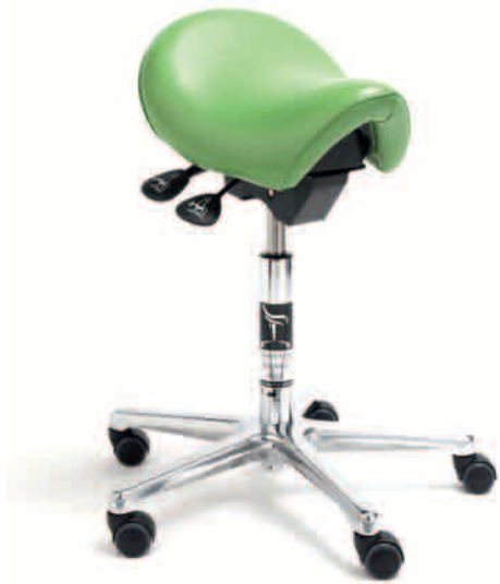
Bambach® Saddle Seat Cutaway Ergotherapeutic Seat