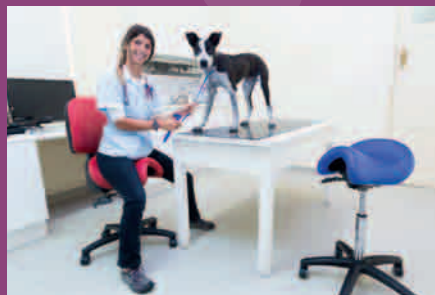
✓ Veterinary practice