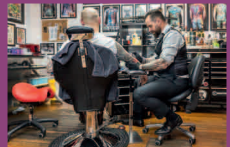
✓ Tattoo studio