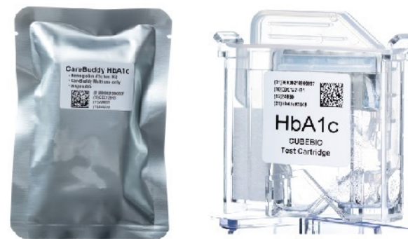
HbA1c Test cartridge